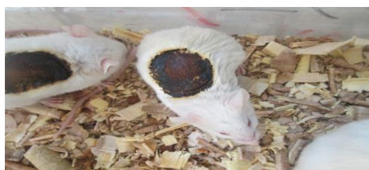
Figure 1. Third-degree burn in male mice.

put them on canonization mattresses upon abdomen and shaved their hair by a razor. Shaved area disinfected with cotton dipped in ethanol. Then we put a 1000 Rial coin with a diameter of 2 cm heated for 3 minutes by a spirit lamp on mice back skin between the shoulder and the neck. We kept the coin 8 second on the above-mentioned area of skin consequently similar strong burns were generated as thermal burns (Figure 1).