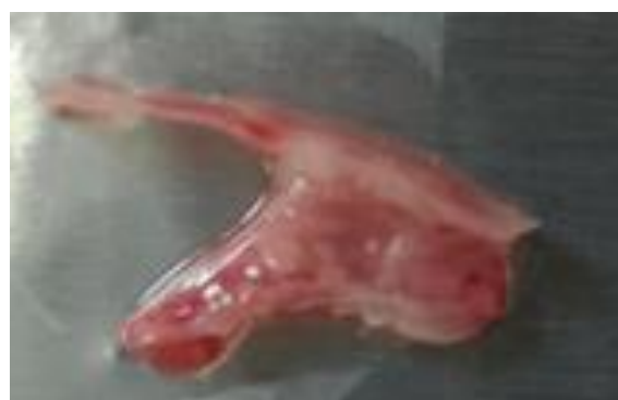
Figure1. Nasal septum of 7-old-day rat pups. Olfactory epithelium isolated from 1/3 posterior part with yellowish appearance.

lower jaw and hard palate, with entry to the area of the nose, nasal septum was separated (Figure1). Then, it is washed several times with a new Phosphate Buffered Saline (PBS) containing 1% of antibiotics and then washed in a solution without antibiotics. Then one third of the posterior septum that contains the olfactory mucosa consisting of olfactory epithelium and lamina propria was separated and transferred to a sterile Petri dish. After crushing the lamina propria into small pieces, using 0.25% trypsin enzyme, enzyme digestion was done after incubation for 10 minutes. Then adding fetal bovine serum (FBS), enzyme activity was halted. Then obtained soup was centrifuged for 10 minutes at 2000 rpm. After discarding the supernatant, supernatant cells were suspended again in 4 ml of culture medium containing FBS 5% and antibiotic 1% and forskolin mitogenic factor 5\mu\text{M} and after transfer to the flask, they were stored in an incubator at 37^\circ\text{C} and carbon dioxide 5%. To remove fibroblast cells, the flasks were replaced 48 hours after cultivation. After 48 hours, the cells begin to stick to the bottom of the flask with two different appearances: Spindle-shaped schwann-like cells and astrocyte-like cells with a flat appearance with multiple redundancies. After 48 hours, the flask culture was replaced. After ten to twelve days of culture, when the bottom of flask was completely filled with proliferated cells, Cell Passage was performed (18).