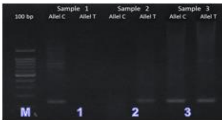
Figure1. Representative of an agarose gel electrophoresis of PCR partial products of IGF1 gene. 1; CC genotype (1 response to C allele), 2; TT genotype (1 response to T allele) and lanes 3; CT genotype (1 response to C allele and 1 response to T allele). M is DNA 100 bp ladder (Fermentas).

The electrophoresis of the PCR products were led to diagnosis of the types of the allele (C/C or T/T in case of 1 response [just response of C or T allele, respectively], and C/T in case of 2 response [both responses of C and T allele]) and genotype of all subjects (Figure 1). The distribution analyses of genotype frequency by the IGF1 gene (C/T polymorphism) in Professional, Amateur karate-kas and Non-athlete groups are shown in Figure 2.