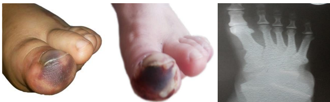
Figure 1. Imaging the left foot.