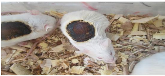
Figure 1. Third-degree burn in male mice.

put them on canonization mattresses upon abdomen and shaved their hair by a razor. Shaved area disinfected with cotton dipped in ethanol. Then we put a 1000 Rial coin with a diameter of 2 cm heated for 3 minutes by a spirit lamp on mice back skin between the shoulder and the neck. We kept the coin 8 second on the above-mentioned area of skin consequently similar strong burns were generated as thermal burns (Figure 1).